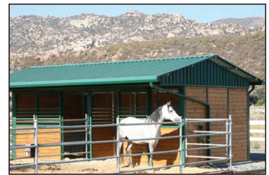
With ULTRA-Cool, you can choose a darker-colored roof without the solar heat concern.

In the past, heat reflectivity can only be achieved by using a light-colored roof material instead of a dark-colored material. FCP's ULTRA-Cool roofing increases heat reflectivity without sacrificing color choice. The revolutionary coating increases the reflectivity