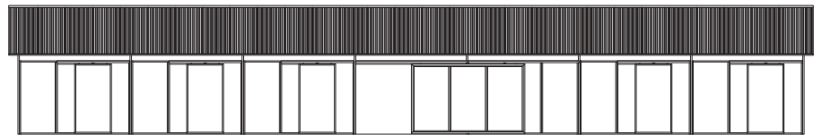
Side Elevation Showing 12' Side Breezeway Door Half Open (Shown with 4' Rear Doors Half Open)